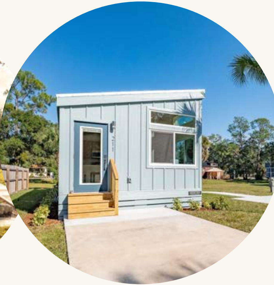
Board on Batten